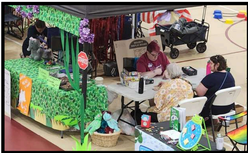
Our Relay for Life booth: reminding all that hope is louder than cancer